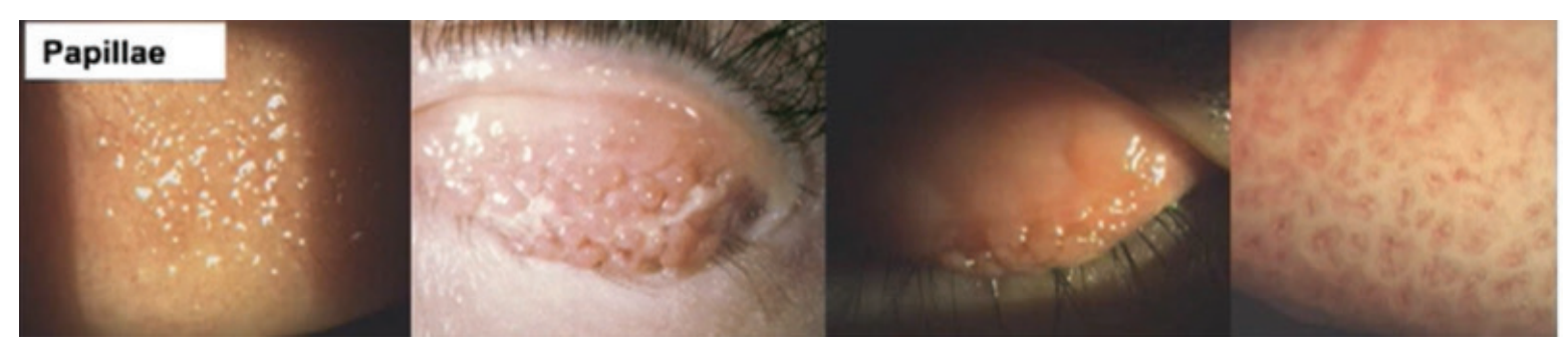
Figure 1. A common clinical sign of ocular allergy.

clinical sign of ocular allergy is the presence of papillae on the underside of the superior eyelid and the conjunctiva on the tarsal part of the eyelid (Figure 1). Follicules may also be visible in the lower part of the conjunctiva, on the acute sac, or around the bulbar conjunctiva. In severe cases in younger patients, a corneal shield or limbal inflammation may be noticeable. With time, eyes that suffer from chronic and severe ocular allergy can also experience limbal stem cell insufficiency.