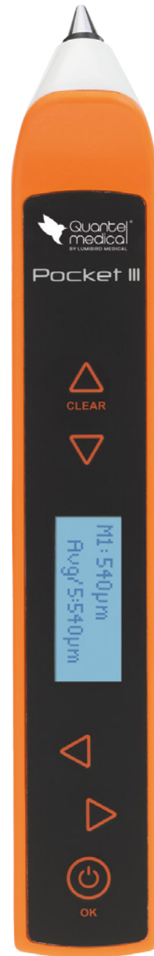
1:1 scale picture

Specifications are subject to change without notice. Non contractual pictures. © 2024, POCKET III® is a trademark of Quantel Medical and Lumibird Medical. All rights reserved. XE_POCKETIII_BC4_AN_240411